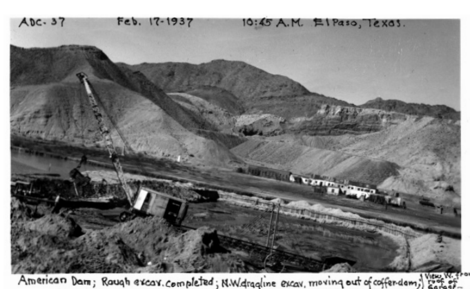
American Dam under construction, February 1937

I am writing Programmatic Agreements (PAs) with the New Mexico State Historic Preservation Office, and have contracted ones for Falcon and Amistad. We just completed our Cultural Resources Management Plan for Falcon Reservoir for archeological resources. The Commission has several Memorandums of Understanding (MOU) in place with other agencies and one with Palo Alto Battlefield National Historical Park of the National Park Service (NPS) for arrangements near old Fort Brown. Fort Brown is the original star fort constructed in 1846 at Brownsville and is still standing (breastworks) and located on the current Fort Brown Memorial Golf Course. This is also a