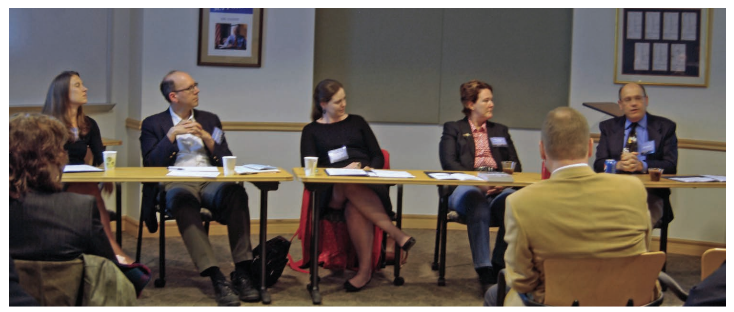
Panel "On Being a Historian for versus a Historian of."