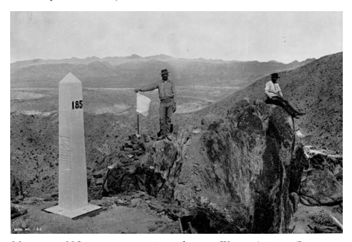
Monument 185 is on a mountain peak east of Yuma, Arizona (International Boundary Commission)

National Historical Landmark administered by the USIBWC in cooperation with the NPS. The landmark is being expanded with NPS help to encompass a larger area than the current one acre. The NPS has also installed a diorama about the battles and fort in the lobby of the clubhouse and offers tours of the area in cooperation with the golf course. NPS archeologists under our MOU likewise help in any archeological matters that occur, as my position is in El Paso and they are 15 minutes away.