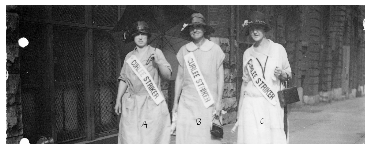
Striking Workers at the Curlee Clothing Company in St. Louis, Missouri, Curlee Clothing Company v. Amalgamated Clothing Workers of America, July 1925.

The company sought a restraining order and injunction against the union, which the court ultimately issued in November 1925. Filed in the U.S. District Court for the Eastern (St. Louis) Division of the Eastern District of Missouri, the court case Curlee Clothing Company v. Amalgamated Clothing Workers of America features a variety of records, including court documents, photographs of the striking workers, testimony by company workers, and evidence of damage to people and property connected with the strike. Not only does this court case provide a link to a critical moment in American labor history, it also put faces and names to a story that seems formal and impersonal in typical court documents.